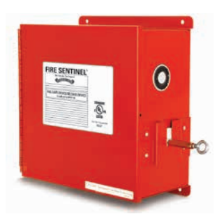
Fire Sentinel® time-delay release device