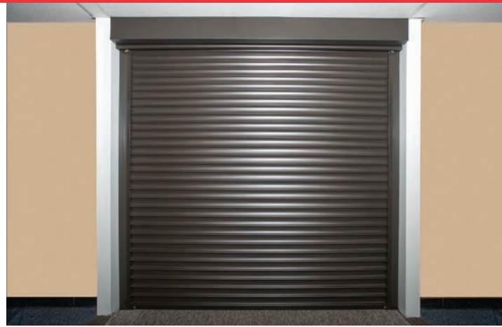
Standard slat, PowderGuard® Premium powder coat finish in Bronze

Allura® Model 653 is a next generation light-duty door solution that is versatile enough for specialty uses and has a space-saving design, making it perfect for installations with limited side room and headroom. Multiple perforation and fenestration options allow for many configurations with the right amount of light and air passage.